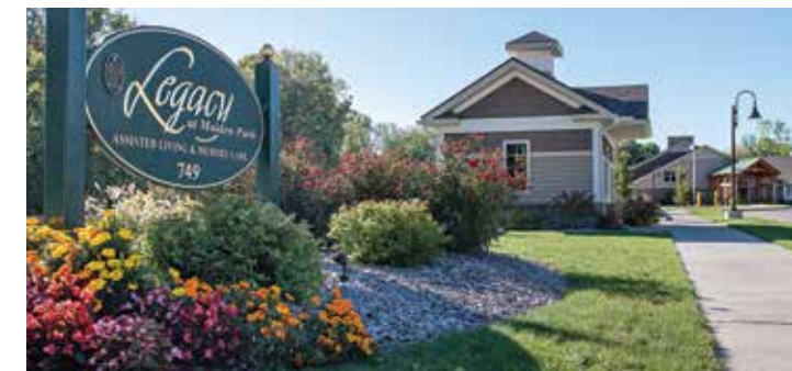
Legacy at Maiden Park in Greece 585-546-7275 ASSISTED LIVING • ENHANCED ASSISTED LIVING MEMORY CARE