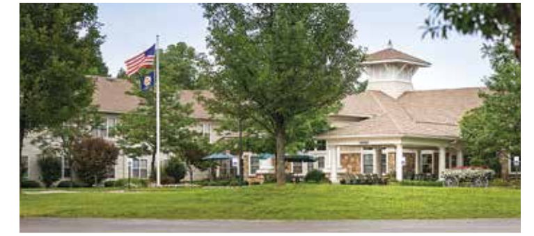
Legacy at Park Crescent in Greece 585-865-0680 INDEPENDENT LIVING • ASSISTED LIVING ENHANCED ASSISTED LIVING • MEMORY CARE