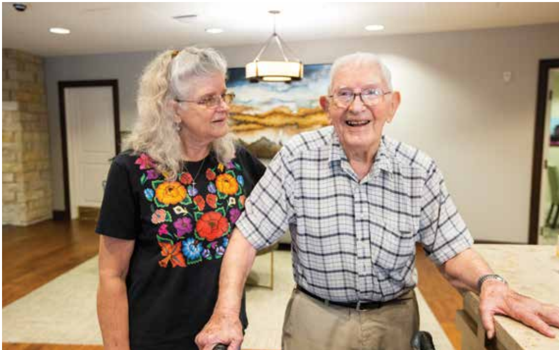
Personalized attention helps people pursue passions and stay healthy.

https://www.wherelivematters.org/category/planning/12