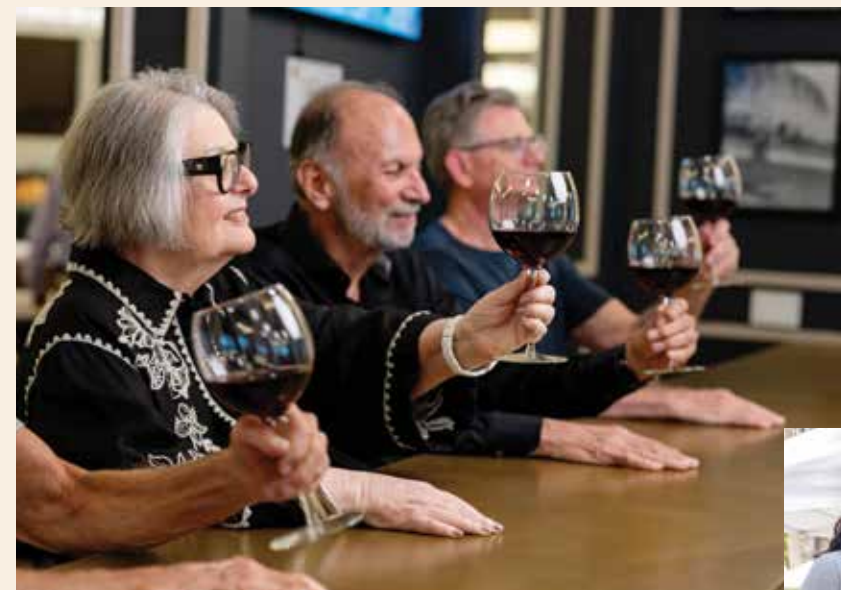
■ Watermark University – Sound Like a Sommelier

A life full of meaning and purpose, infused with curiosity and the invitation to learn, teach, and grow. Watermark University makes it possible to pursue lifelong passions, discover new interests, and foster meaningful connections through enriching programs and classes on topics ranging from art workshops and history lessons to culinary courses, mindful meditation, and more. Members and associates are encouraged to become instructors themselves, venturing past entertainment into engagement.