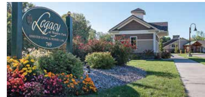
Legacy at Maiden Park in Rochester 585-546-7275 ASSISTED LIVING • ENHANCED ASSISTED LIVING MEMORY CARE