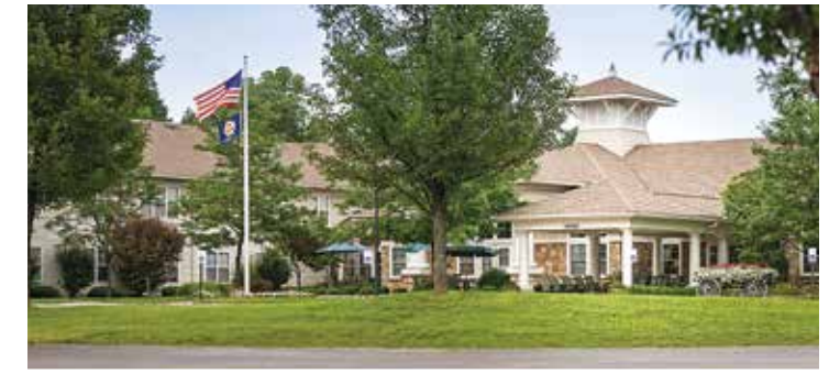
Legacy at Park Crescent in Greece 585-865-0680 VILLA LIVING • INDEPENDENT LIVING